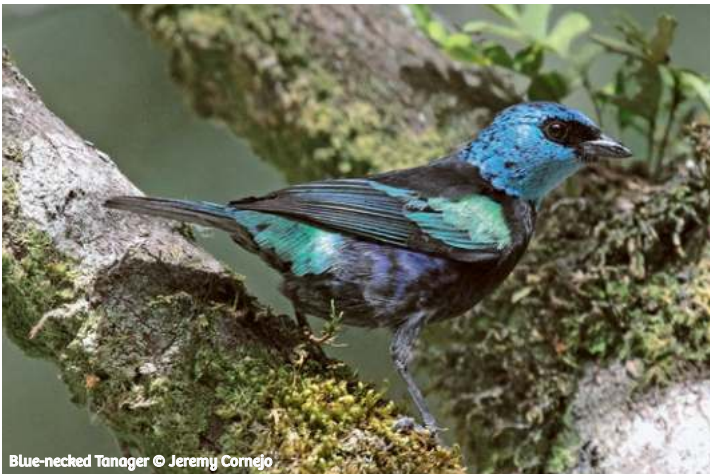
Blue-necked Tanager

the Urubamba valley with access along the railway line (be careful of trains!). Mixed flocks are a major attraction here and highlights can include: Ocellated Piculet, Sclater's Tyrannulet, Andean Cock-of-the-Rock, Masked Fruiteater, Rust-and-yellow Tanager, and Silvery Tanager.