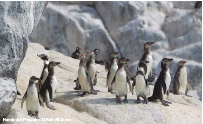
Humboldt Penguins