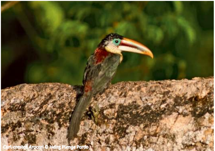
Curl-crested Aracari

The Madre de Dios river slows down after the Manu river joins it and the area between Boca Manu and Blanquillo has several good birding lodges with good trail networks accessing diverse habitats. The lake of Cocha Blanco is a good birding destination with Purus Jacamar being seen regularly. The claylick of Collpa Blanquillo is one of the best in the area, attracting hundreds of birds on a good day. Downstream of Boca Colorado there is considerable mining activity but the standout area of Los Amigos Conservation Concession has