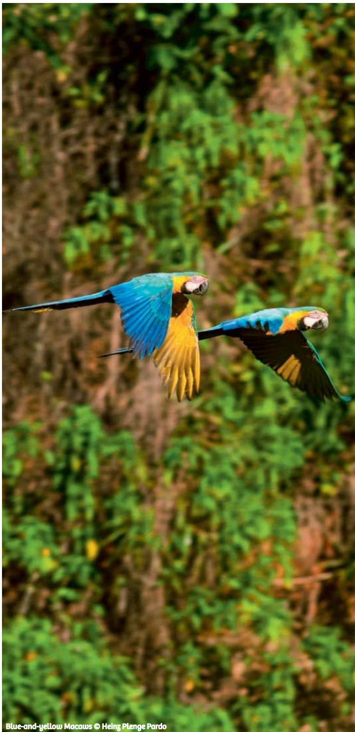
Blue-and-yellow Macaws