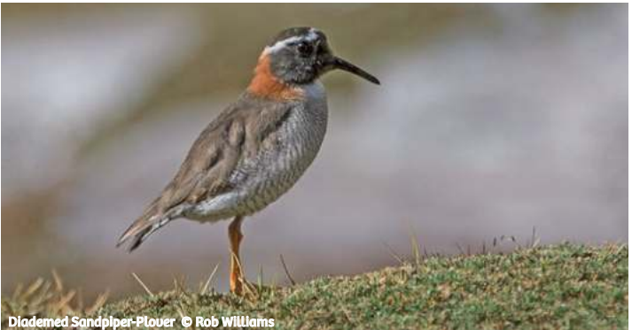
Diademed Sandpiper-Plover

Quebrada La Chiguata area just above the city of Arequipa is an area of agricultural fields Polylepis scrub with highlights including: White-throated Earthcreeper, and the arequipae subspecies of Creamy-breasted Canastero, Black-hooded Sierra Finch and seasonally the rare Tamarugo Conebill. The Colca Canyon is a spectacular site and also an important birding area. Globally famous for the incredible views of Andean Condor that can be obtained at the Cruz del Cóndor viewpoint, where these impressive birds pass at eye-level as